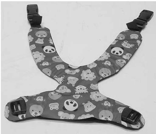
Image below shows installed device.