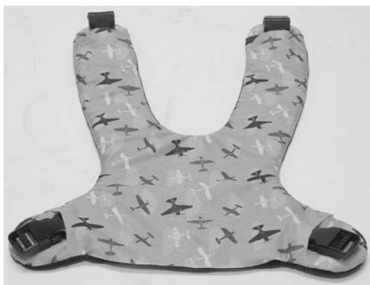
Image below shows installed device.